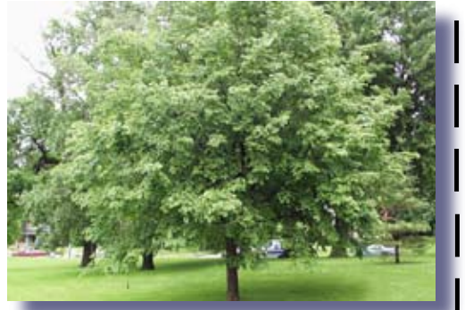
Mature Eastern Hophornbeam Tree

The Leon County Department of Public Works is proud to offer the 2008 Adopt-A-Tree public tree planting program. If you live inside Leon County, but outside of Tallahassee city limits, you may qualify to have an eastern hophornbeam