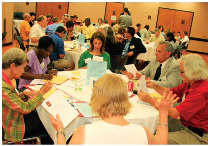
Citizen Engagement Series: Library Services

...Continued, Message from the County Administrator