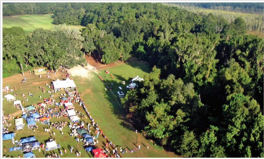
Leon County Apalachee Regional Park Trail