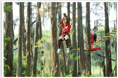
Tallahassee Museum Zipline Course