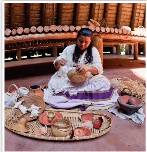
Mission San Luis

Did You Know Leon County Tourism Development awarded over 110 grants to support local organizations and events.