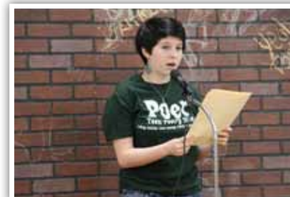
2011 Poetry Slam