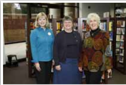
Northeast Branch Library Ribbon Cutting