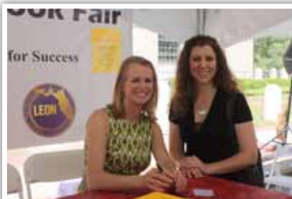
3rd Annual Book Fair