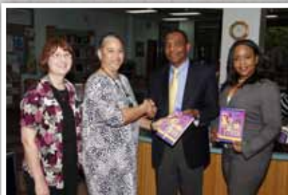
Caribbean American Heritage Council Donation