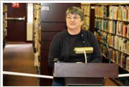
Northeast Branch Library Ribbon Cutting