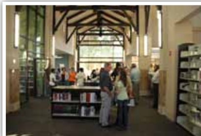
Eastside Branch Library Grand Opening