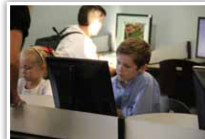
Eastside Branch Library Grand Opening