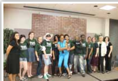
2011 Poetry Slam