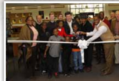
B. L. Perry Branch Library Ribbon Cutting