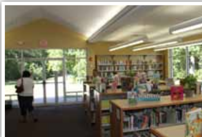
Woodville Branch Library Grand Opening