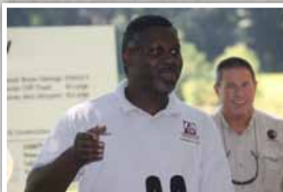
Eastside Branch Library