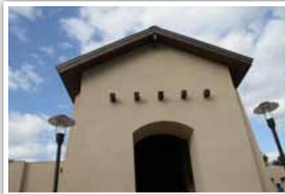
Eastside Branch Library Grand Opening