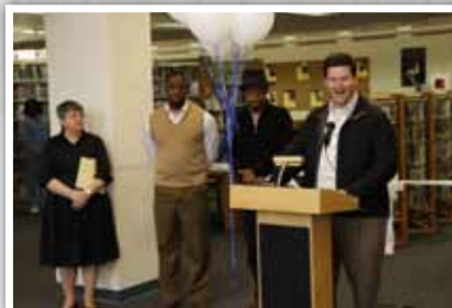
B. L. Perry Branch Library Ribbon Cutting