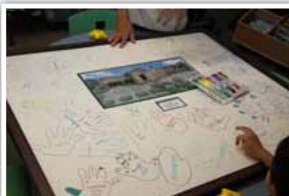
Eastside Branch Library Grand Opening