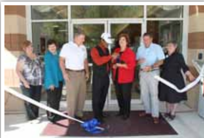
Woodville Branch Library Grand Opening