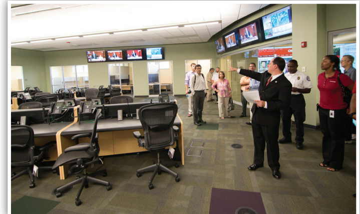
Emergency Operations Center at the Public Safety Complex