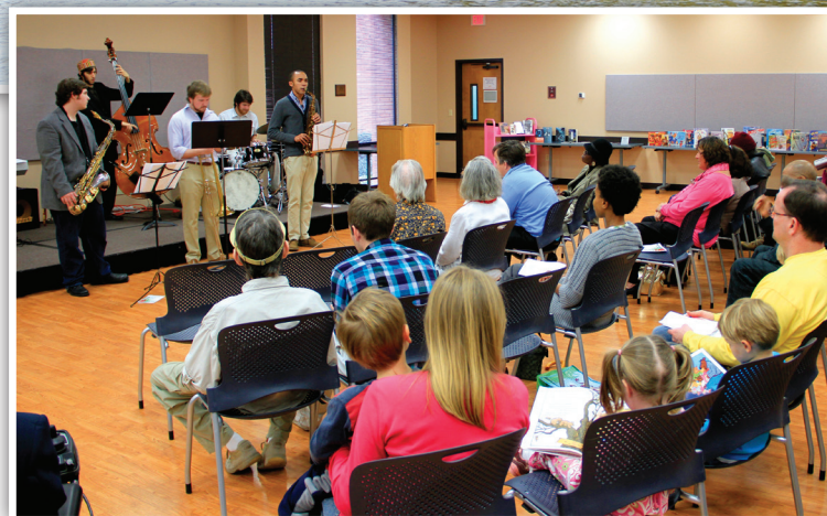
Jazz Concert at the Main Library