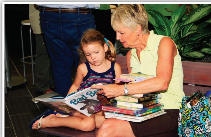
Story Time at Lake Jackson Branch Library

support the needs of a growing community surrounding their North Monroe Street location. The Community Center hosts two meeting rooms, which are available for the public's use and for the library's programs. Its large meeting room seats 85 and the smaller meeting room seats 38. Audio/visual equipment and a warming kitchen are also available.