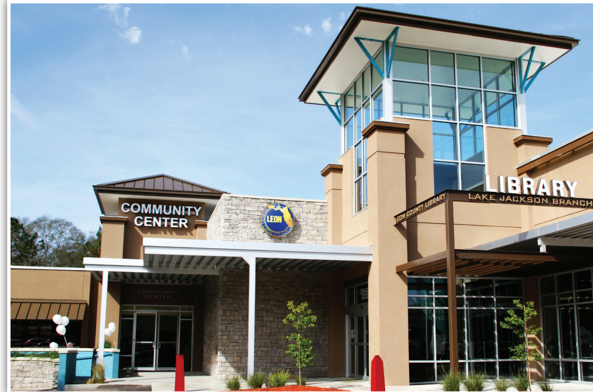
Lake Jackson Branch Library and Community Center