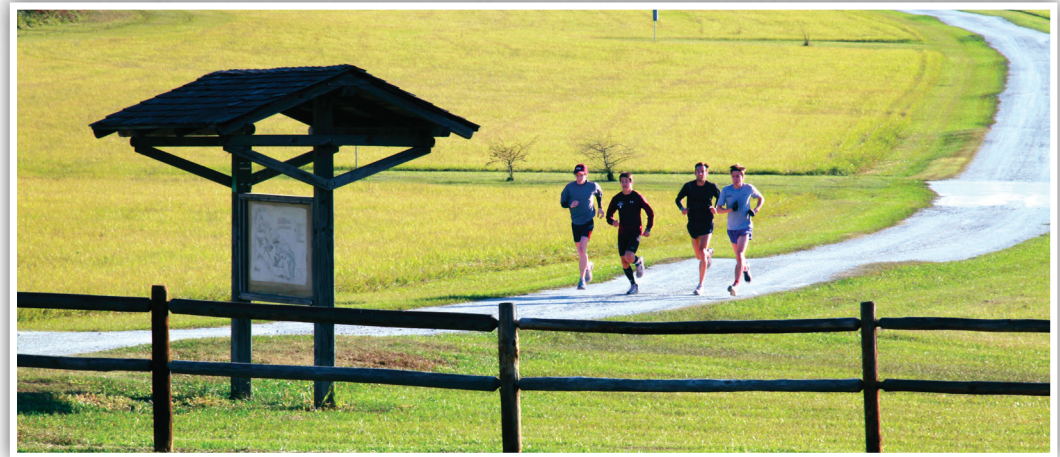
J. R. Alford Greenway