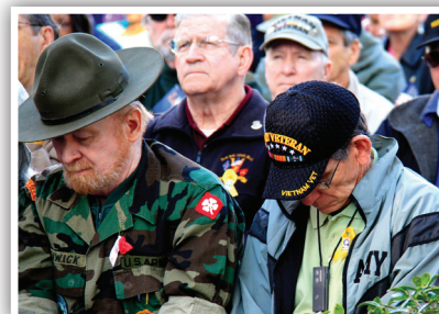
Operation Thank You