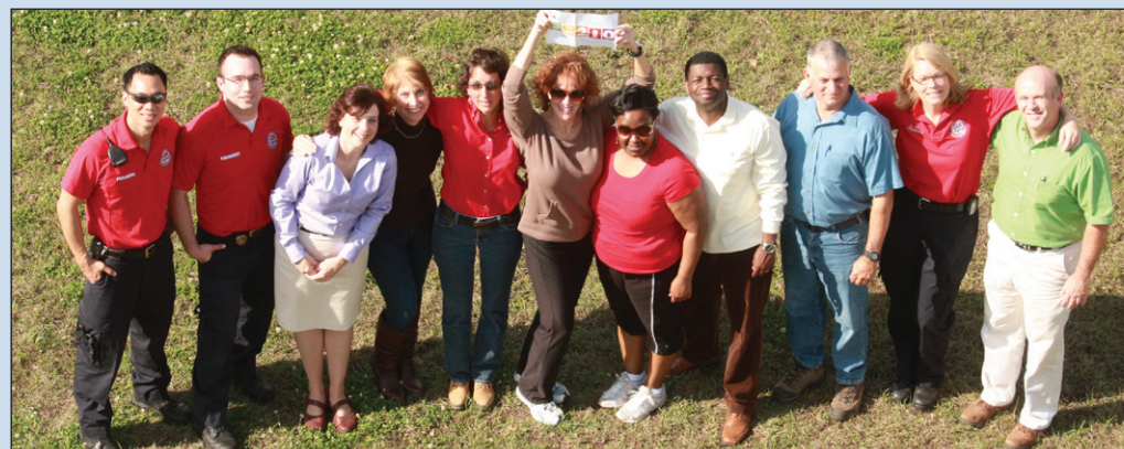
Wellness Works: 95210 Project Kickoff