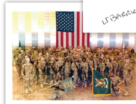
Thank You letter from 160th MP Battalion

Volunteering can improve your health. New research from the Mayo Clinic shows that people who volunteer have lower rates of heart disease and live longer.